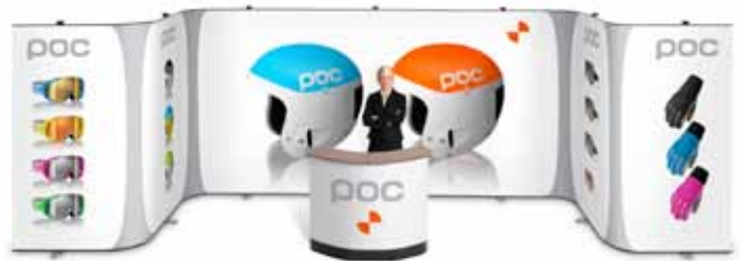
Open U shape