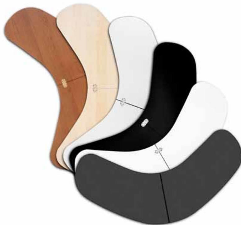
Table tops in oak, birch, aluminium, black, white & black plastic. The black plastic version is a lightweight table top that also can be used outdoors.