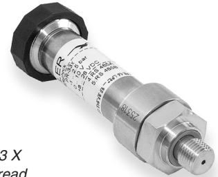
Series 33 X G1/4" thread

The transmitter's full-scale output can be set up to match any standard of your choice by correcting the gain with the PROG30 software.