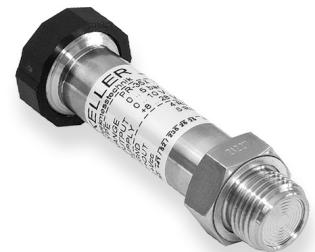
Series 35 X G1/2", flush diaphragm