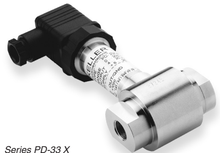
Series PD-33 X