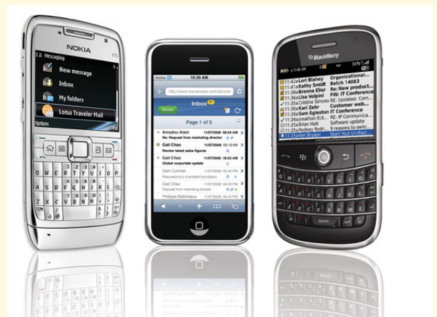
Figure 1. Access Lotus Notes and Domino software on the device of your choice.