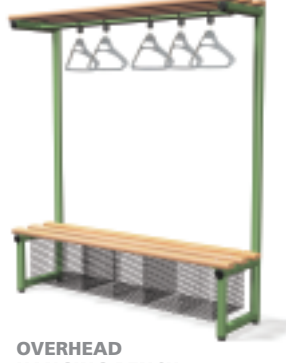
HANGING BENCH single sided with timber slats, baskets and anti-theft hangers