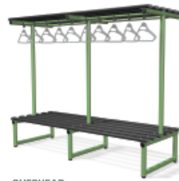
OVERHEAD HANGING BENCH double sided with polymer slats and anti-theft hangers